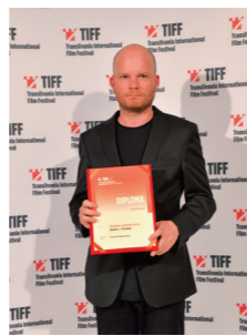
↑ Grimur Hákonarson