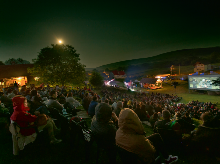
↑ Special screening of Comoara in Archai Sculpture Park, Vlaha