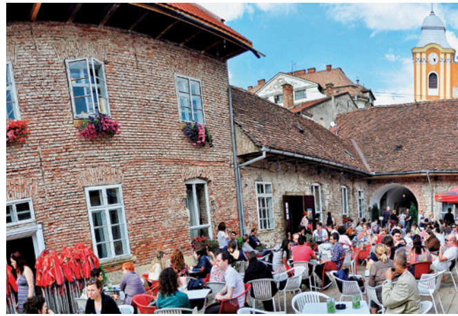
↑ CASA TIFF ↓ TIFF Volunteers

THE NEW Transilvania IFF website attracted 45,000 unique visitors from 93 countries during the 10 days of the festival. The mobile version m.tiff.ro generated 5000 hits. Overall, www.tiff.ro, with daily updates, photos and videos peaked a record number of 92,891 hits from June 1st till June 10th, while the festival's page on Facebook received 7000 new fans, for a total of 24,000 .