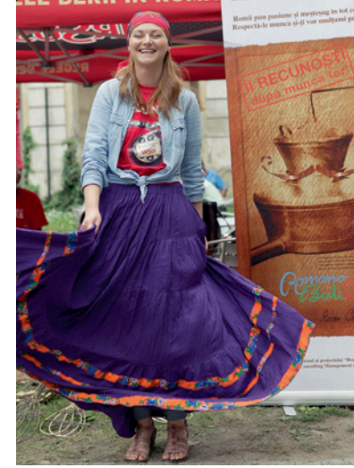
↑ Diversity Day ↓ HBO Party → Laibach Concert