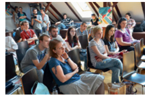
↑ Transilvania Talent Lab