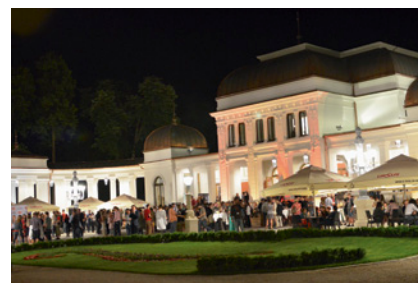
← Cine-concert Georges Méliès